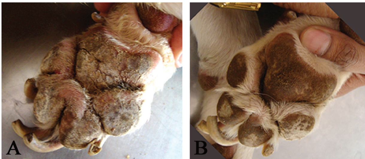
Fig. 2. Podo-dermatitis (A - Before treatment; B - After treatment).

dL) and blood urea nitrogen (26 - 43 mg/dL) levels. Microscopic examination of the Leishmans's stain peripheral blood smears revealed presence of the Babesia gibsoni organisms. Babesia gibsoni organisms were identified based on their morphology consist of the single merozoites with in the red blood cells (Fig. 3).