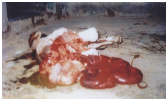
Fig. 4: Schistosomus reflexus bovine foetal monster with retroflexed and ankylosed and ectopic evisceration.