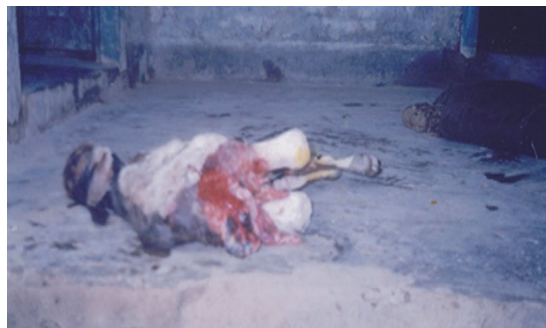
Fig. 5: Bovine foetal monster resembling Schistosomus reflexus with eventration of all abdominal organs (viscera ectomised).

The cause of Schistosomus reflexus still remains ambiguous. However, many authors are in opinion that genetic factors and or interplay of multiple genes could influence on the occurrence of such monstrosity (Roberts loc. cit. Leipold and Dennis 1986, Jana and Ghosh 2001). Four Schistosomus reflexus cases presented in this paper belonged to small, marginal farmers of West Bengal where the indigenous cattle were maintained on stray grazing and the cows had been mated closely with related animals. Looking to the aforesaid observations the Schistosomus reflexus fetuses appeared to be a sequel of genetic abnormality.