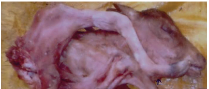
Fig. 2 : Schistosomus reflexus bovine foetal monster with dorsiflexion of foetal spinal column. (All the visceral organs removed during obstetrical procedure).