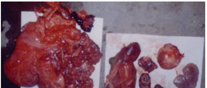
Fig. 3: Thoraco abdominal visceral organs as removed from the monster foetus No. 2.

form of an abdominal hernia associated with skeletal defects and this arises in early embryonic life when the lateral edges of the germinal disc are reflected dorsally instead of ventrally to form the body cavities.