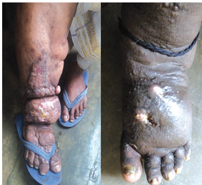
Fig. 1. Elephantiasis with ulcer.

Our study was conducted on wound samples of patients with filarial elephantiasis with ulcerations, attended the Filaria OPD, School of Tropical Medicine, Kolkata, India. The samples received were from different districts of West Bengal as well as from outside of West Bengal. A total of 100 wound samples were collected from the patients.