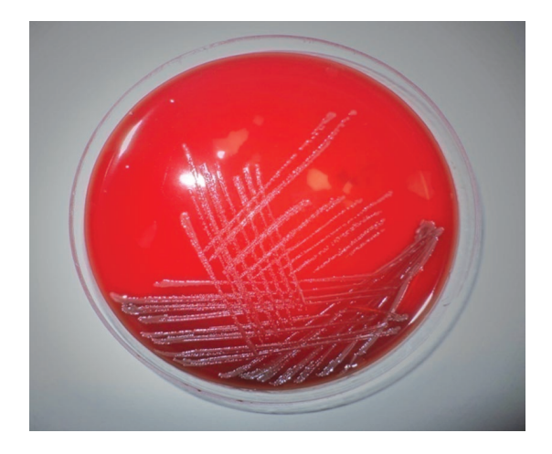
Fig.1: Showing Cultural Character of Pas teurella multocida in blood agar.