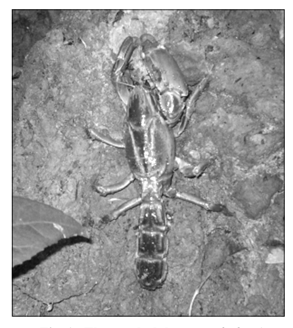
Fig 1: The mud lobster, Thalassina

mud particles are meticulously manipulated and sorted out by very specialized mouth apparatuses namely mandible and mandibular palp, 1<sup>st</sup> & 2<sup>nd</sup> maxilla and 1<sup>st</sup>, 2<sup>nd</sup> & 3<sup>rd</sup> maxilliped. These apparatuses are marvelously modified for providing successive selected grades of setal sieves. Through these animated sieve apparatus finest food particles impregnated with organic micronutrients are passed through gut. Functional morphology of burrows is related with tropic modes of the animal.